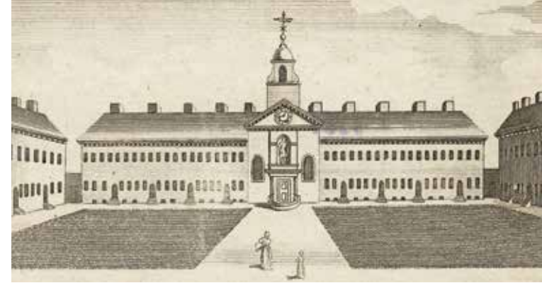
The Ironmongers' Almshouses from an 18th-century engraving

Fairchild was one of London's most celebrated nurserymen of the early 18 th century, who crossed a carnation with its cousin, the Sweet William, to create the first artificial hybrid. He called this phenomenon Fairchild's Mule, as it was barren. Given the strict hierarchical nature of 18 th -century society, when a paper was presented about the Mule to the Royal Society, Fairchild was allowed to attend, but as a working man and thus not eligible to be a member, he had to have his paper read out by another. At his death in 1729, Fairchild asked for his body to be buried in the part of the burial ground reserved for the poor, leaving various charitable bequests including the annual sum of £25 to St Leonard's for the preaching of a sermon on 'the wonderful works of God in the creation'. He may have chosen this particular subject as some would suggest that the creation of Fairchild's Mule was tampering with God's works.