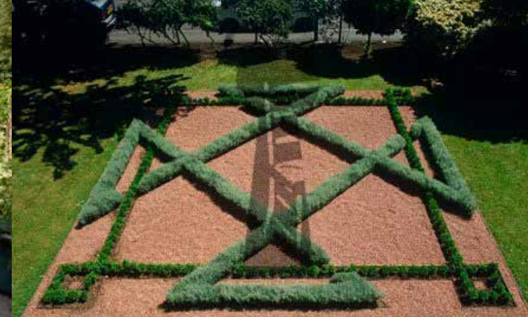
The Tudor knot garden under construction

In a 'Good Gardens Guide' compiled by J. Gibson in 1691, we get some details of these. Ricketts had the largest, 'abundantly stocked with all manner of flowers, fruit-trees, and other garden plants, with lime trees ... and for a sale garden, he has a very good greenhouse, and well filled with fresh greens, besides which he has another room very full of greens in pots'. Darby had a much smaller garden, but grew unusual greens that he over-wintered in greenhouses of his own making.