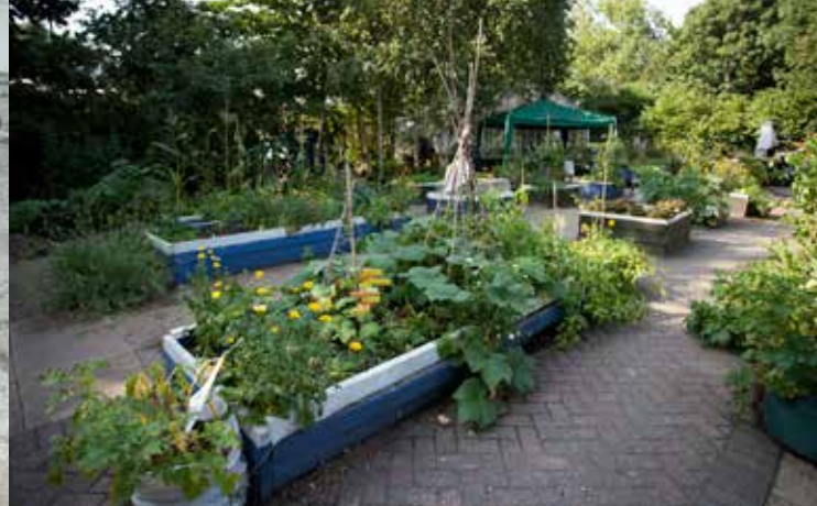
St Mary's Secret Garden