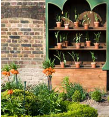
The auricula theatre in the Georgian garden (right Bertie's 'Royal Sportsman' Auricula)