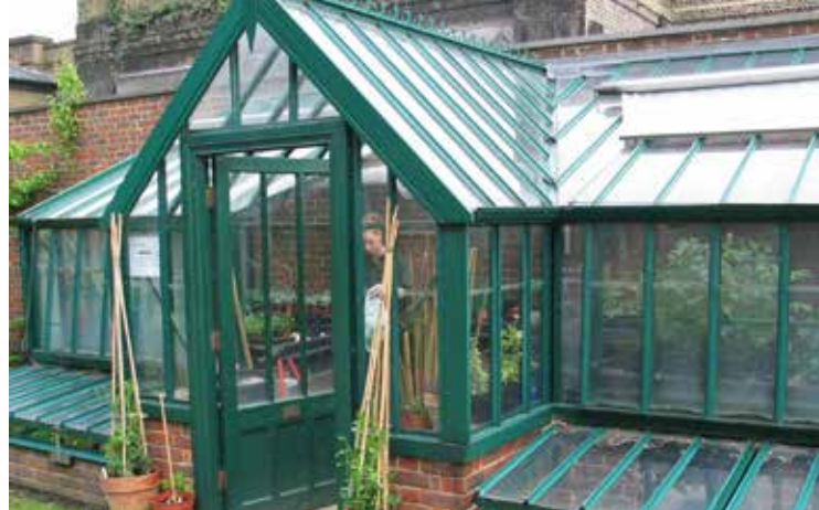
The greenhouse in the Victorian garden

The Elizabethan garden to the right of the walled herb garden also has some herbs growing in raised beds. Two features of more sophisticated gardens of the period are the knot garden and an arbour or herber. The Elizabethans loved complex patterns, in geometric shapes, or sometimes in the form of a heraldic animal. The knot garden at the Geffrye, planted with santolina and hedge germander, is based on the pattern of a wooden panel of an early 17 th -century cupboard in the museum's collection. The arbour has a framework of hazel, over which roses clamber in the summer. It provided welcome shade from the sun, and Shakespeare