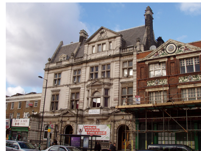
Fig 12: Kings Hall Leisure Centre and 43 Lower Clapton Road 2013