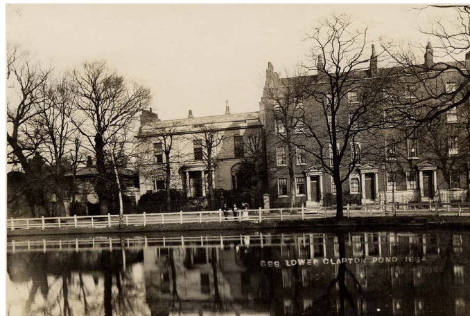
Fig 1: Clapton Pond (with Pond House and former St James Terrace in the background) c.1884

Pond House, 162 Lower Clapton Road, was built for Benjamin Walsh, a stockbroker, soon after 1800. It was used as a home until the 1880s, a school until 1904, then a clothing factory. From 1939 to 2001 it was occupied by the Hackney Volunteers Social Club. It is now being converted into flats.