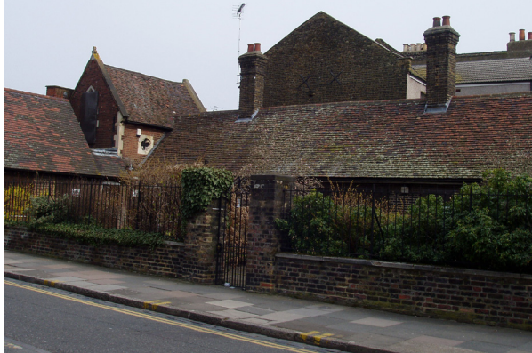
Fig 4: Bishop Wood's Almshouses

Pond Neighbourhood Action Group. A plaque on number 25 records that the first synagogue in the present-day London Borough of Hackney, built 1779-80 (5539-5540), stood to the rear of this building in the grounds of Clapton House.