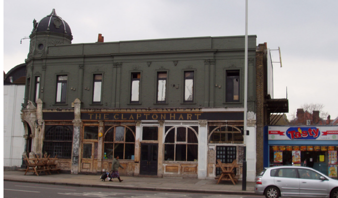
Fig. 5: The Clapton Hart 2013

The nave of this Gothic Revival church was built in 1840-41 by Edward Charles Hakewill. The red brick chancel