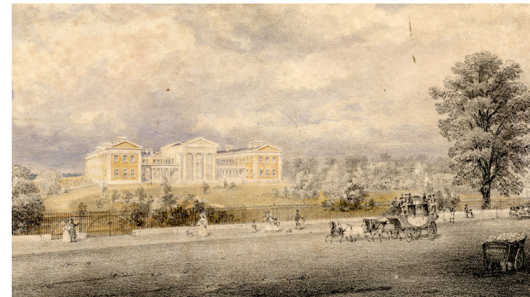
Fig 18: London Orphan Asylum, colour lithograph, George Hawkins, c.1830