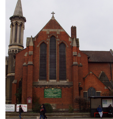
Fig 7: Church of St James the Great 2013