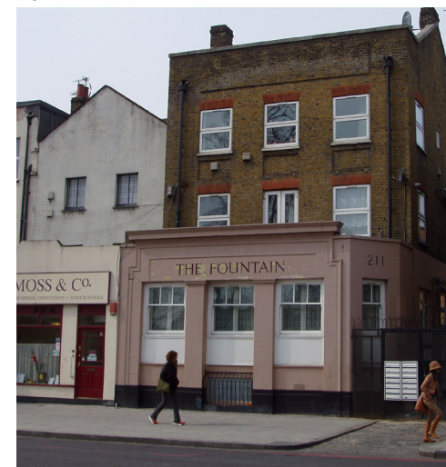
Fig 8: The Fountain 2013

A brown plaque on Clapton Pavement (1880), at the corner of Lower Clapton Road and Clapton Passage, commemorates the philanthropist, educationalist and