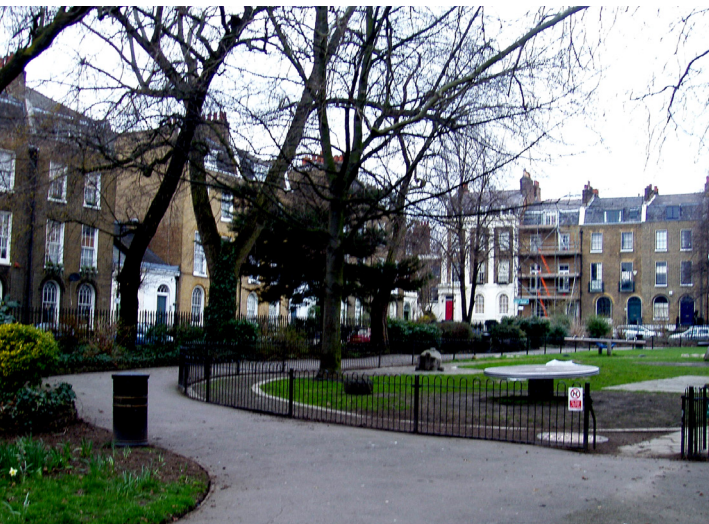
Fig 13: Clapton Square 2013

The Clapton Portico in Linscott Road is all that remains of a building (1823-25) designed by William Southcote Inman to house the London Orphan Asylum. Following the asylum's move in 1871, the building was occupied by a number of organisations, and was bought by the Salvation Army in 1882. In 1969 it became the property of Clapton Girls' School, and the main building was demolished in the 1970s. The Grade II listed Portico was restored in 2005 by Brady Mallalieu Architects.