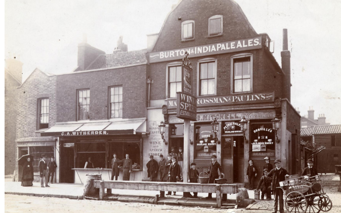
Fig. 10: Windsor Castle c. 1880

The Kings Hall Leisure Centre at 39 Lower Clapton Road opened as Hackney Baths in 1897. It was built by Edward Harnor and Frederick Pinches, following Hackney's adoption of the 1846 Public Baths and Wash Houses Act in 1891.