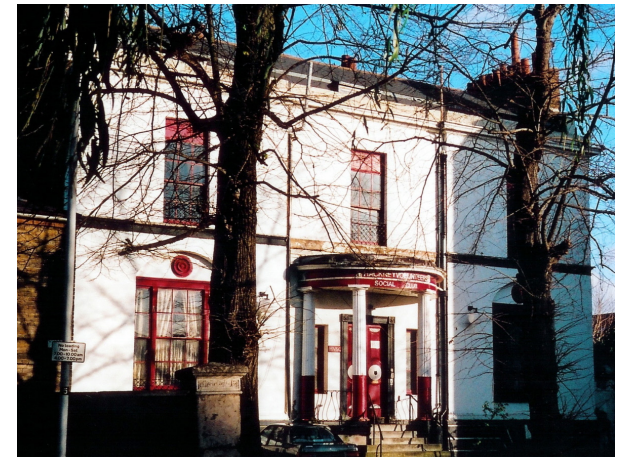
Fig 3: Pond House 2006 © Malcolm Smith

The writer Harold Pinter grew up at 19 Thistlewaite Road. In 2012 Lady Antonia Fraser Pinter, his widow, unveiled a plaque that had been sponsored by Clapton