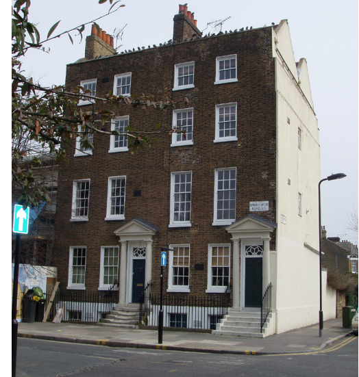
Fig 2: 158 and 160 Lower Clapton Road 2013