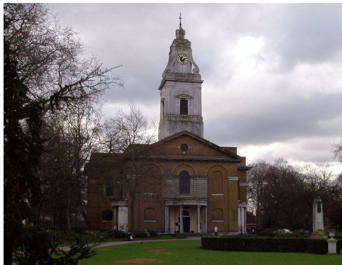
Fig 14: St John at Hackney 2013

This school opened in Cassland Road in 1906 as County Secondary School for Girls, South Hackney. It moved to Laura Place in 1916. Following several changes of name, it became Clapton Girls' Academy in 2011. The Laura Place site was extended in 1975. In 2010 it was updated by Jestico & Whites with 40% new buildings and 60% refurbished buildings. This refurbishment was a winner of the Hackney Design Awards 2010.