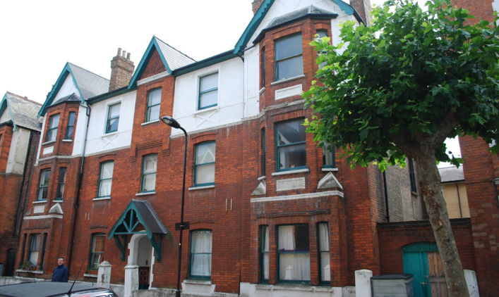
Fig 9: Rowhill Mansions 2012

prominent lay churchman, Joshua Watson, who lived in a house on this site (117 Lower Clapton Road) from 1811 until 1823 and from 1841 until 1855.