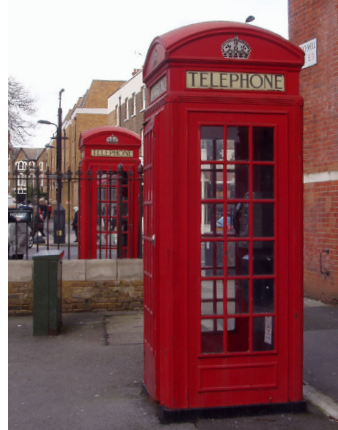
Fig 15: Churchwell Path phone Kiosks