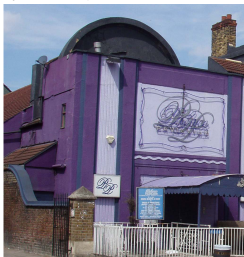
Fig 6: 229 Lower Clapton Road 2008