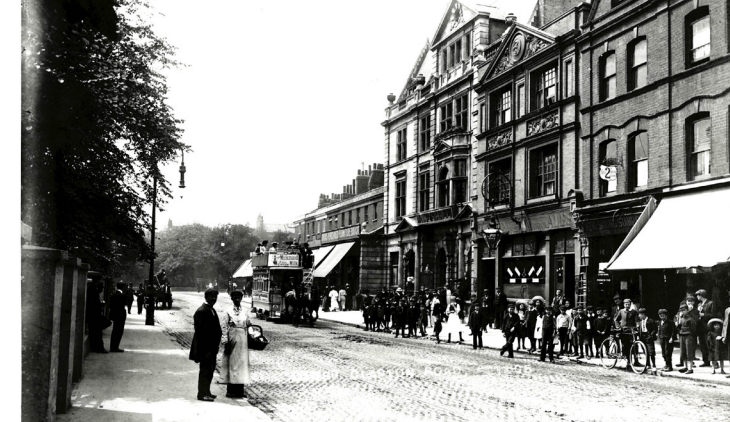
Fig 11: Kings Hall and Baths 1905

Hackney Police Station at 2 Lower Clapton Road was designed by John Dixon-Butler and built in 1904 for the Metropolitan Police. It includes offices, cells and section house. It closed in 2013.