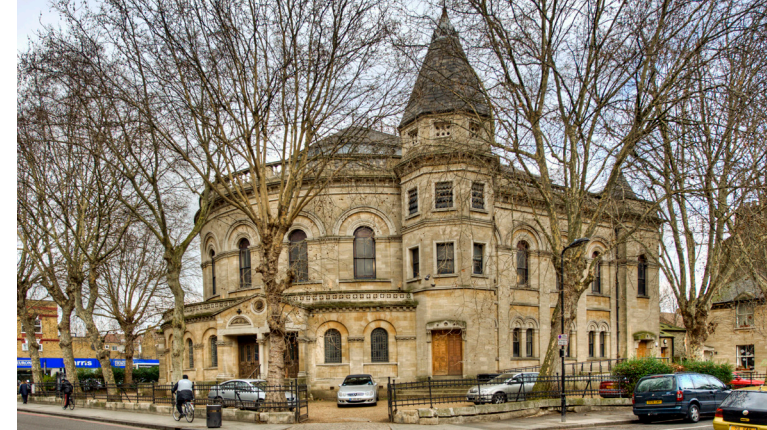
Fig 17: The Round Chapel 2012 © Richard Allen