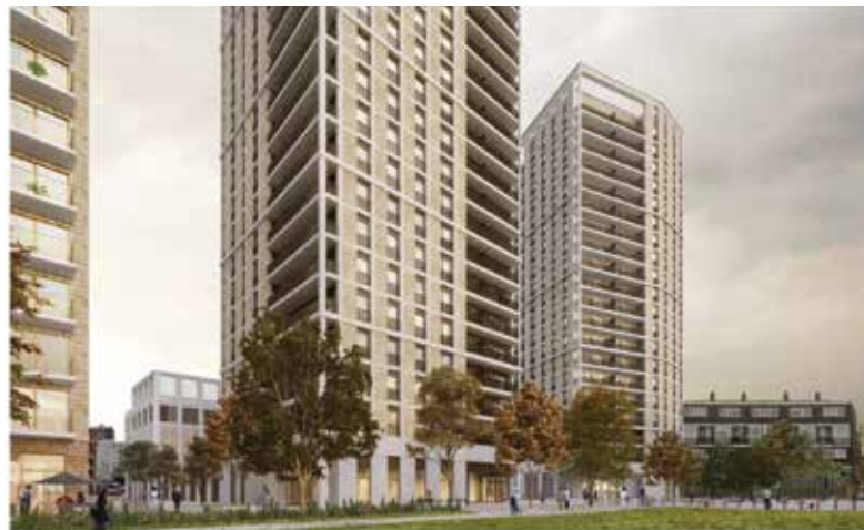
View from Shoreditch Park of new BRAFA Square and North Street