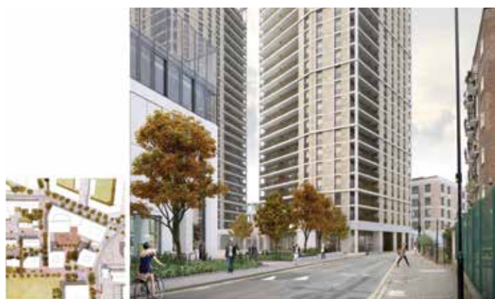
View from Pitfield Street