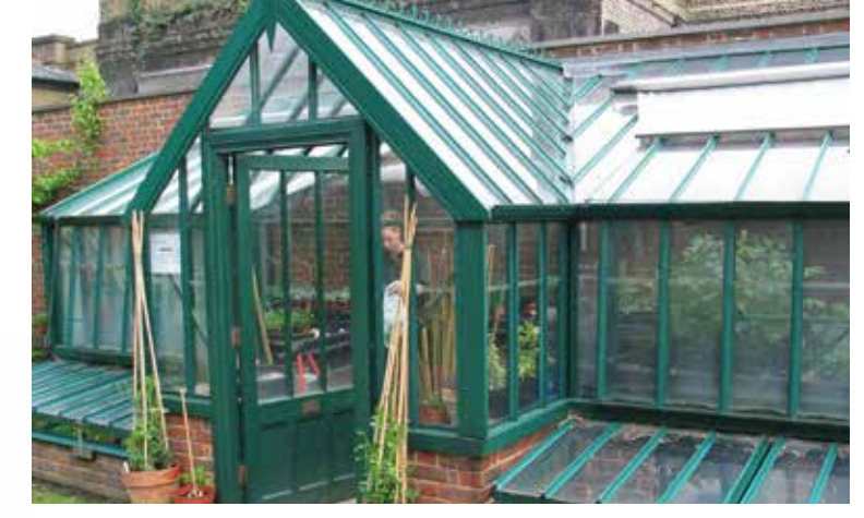
The greenhouse in the Victorian garden

The Elizabethan garden to the right of the walled herb garden also has some herbs growing in raised beds. Two features of more sophisticated gardens of the period are the knot garden and an arbour or herber. The Elizabethans loved complex patterns, in geometric shapes, or sometimes in the form of a heraldic animal. The knot garden at the Geffrye, planted with santolina and hedge germander, is based on the pattern of a wooden panel of an early 17<sup>th</sup>-century cupboard in the museum's collection. The arbour has a framework of hazel, over which roses clamber in the summer. It provided welcome shade from the sun, and Shakespeare