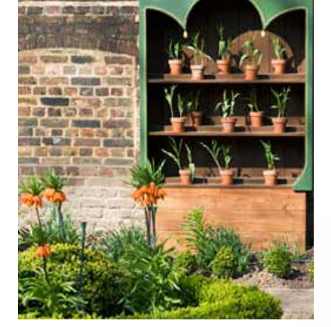
The auricula theatre in the Georgian garden (right Berties' 'Royal Sportsman' Auricula)

published in 1652 and is still in print, would have cultivated many of the herbs featured here at his home in Spitalfields. His principal focus was plants to make up into