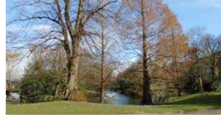
Springfield Park

During the 18th and 19th centuries the original Broad Common was reduced in size as sections were given over to residential