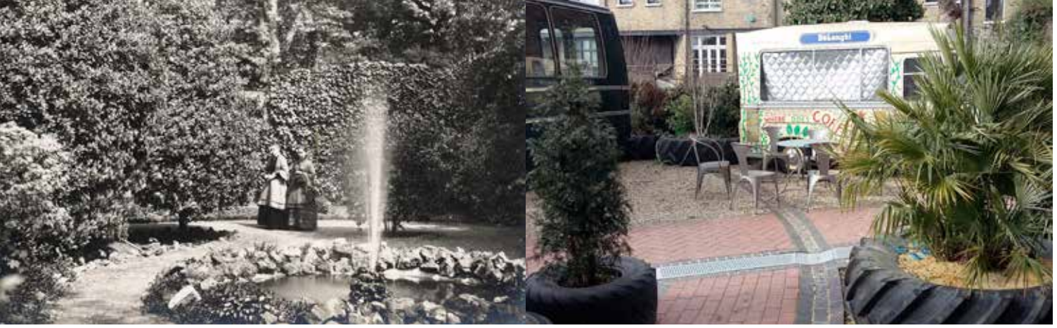
Pond House garden, 1880

company continues to flourish from a factory in the West Midlands and the essential features of Haws' design have remained unchanged to the present day.