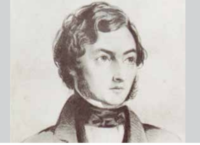
Sir Hugh Low

The Cedar of Lebanon tree at the junction of Upper Clapton Road and Springfield was a mature tree when Nelson won the battle of Trafalgar. It was part of the