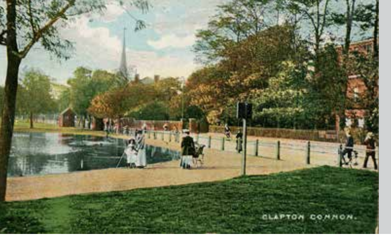
Clapton Common c.1903

but he takes a great deal of delight in it notwithstanding, and if you are desirous of paying your attention to his youngest daughter, be sure to be in raptures over every flower and shrub it contains.'