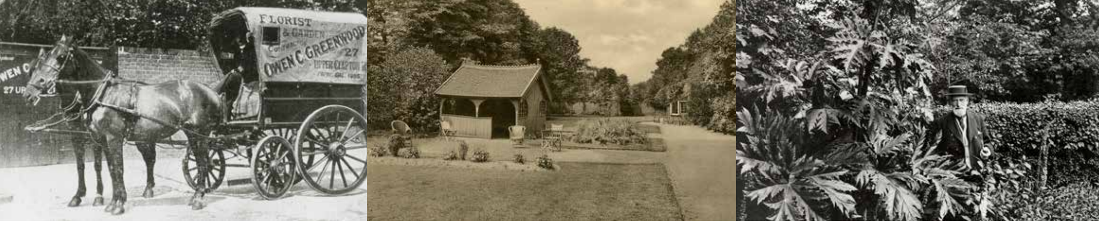
Owen C Greenwood horse-drawn delivery van c.1910